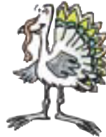
Terry Turkey 211