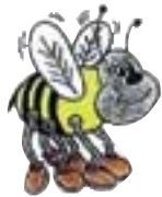
Buzzter Bee 400