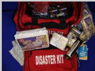
Three Day Disaster Kit w/ Additional Duffle