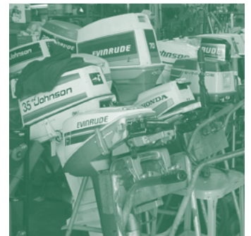
The county visited ten marine engine repair shops.

Of all the types of small businesses that generate hazardous waste in Thurston County, the automotive industry is the biggest. There are hundreds of auto repair shops alone. Many have received technical assistance visits from the Business Pollution Prevention Program. This campaign was the county's first look at businesses that service and repair small engines not normally associated with cars and trucks. Businesses included lawn and garden equipment, wood cutting equipment, motorcycles and all terrain vehicles, marine engines, portable pumps and generators, and the like.