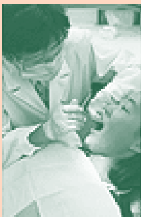
Dental amalgam can contain 50% mercury, 25% silver, and 25% a mixture of copper, zinc, and tin.

Environmental regulators across the nation are working to reduce metal waste from dental offices. Thurston County will conduct a technical assistance campaign to help dentists reduce their heavy metal discharge. Their goal is to be proactive and provide dentists with the resources necessary to comply with changing regulations regarding heavy metals. ♦