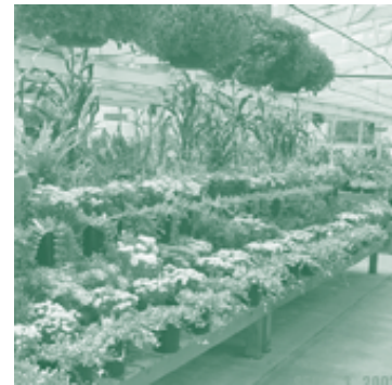
One-third of local nurseries visited practice integrated pest management to reduce use of pesticides.

Nurseries tend to use up hazardous products; therefore, they produce very little pesticide