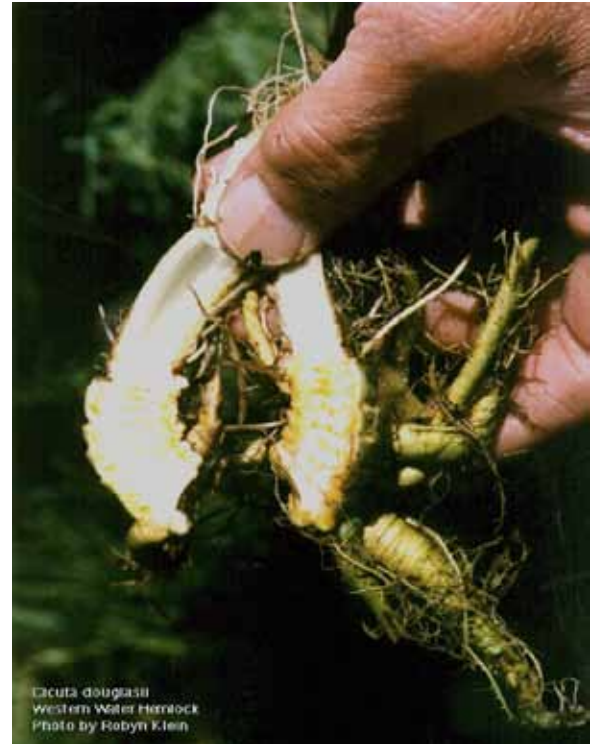
Cicuta douglasii Western Water Hemlock

BE AWARE! Spraying may cause the stems and leaves of water hemlock to become more attractive to grazing animals. Livestock should be excluded from sprayed areas for a minimum of three weeks.