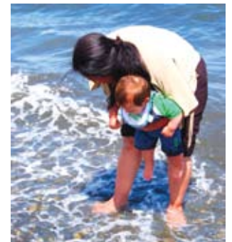
Wading in Puget Sound

However, the health of the environment where shellfish grow ultimately affects us all. If pollution levels are too high to produce consumable shellfish, then we're not only hurting shellfish growers, we're degrading the very water that makes our region such a desirable place to live.