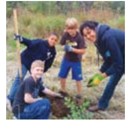
Nisqually River Education Project students