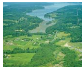
Henderson Inlet at the mouth of Woodland Creek

With every splash upon an oar, with every oyster harvested on a serene day, with every beautiful view that leaves us breathless, Puget Sound begs us to not be complacent about its future. Here in the Henderson Inlet - Nisqually Reach region, we've heard the call and have good news to report. Improvements in water quality in northern Henderson Inlet have enabled the state Department of Health to reopen 240 acres of shellfish-growing tidelands for harvest without weather restrictions.