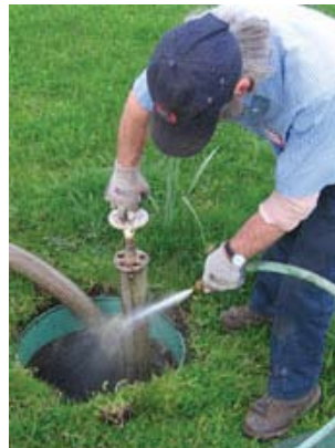
Septic system maintenance

Hundreds of minor repairs have also been accomplished. At the top of the list for minor repairs is the repair or replacement of septic tank baffles.