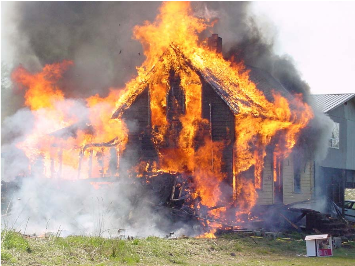
Fire destroys a meth lab home in the town of Bucoda.

owner's son and stepson were cooking the drug. When officers went to a separate house where she was living nearby, they found the cooks had also set up labs in the upstairs of that home; areas she could not reach because of physical ailments. With assistance from law enforcement and Thurston County Environmental Health, she was able to return to her home after cleanup was accomplished and her abandoned home was burned to the ground and used as practice for the Bucoda Fire Department.