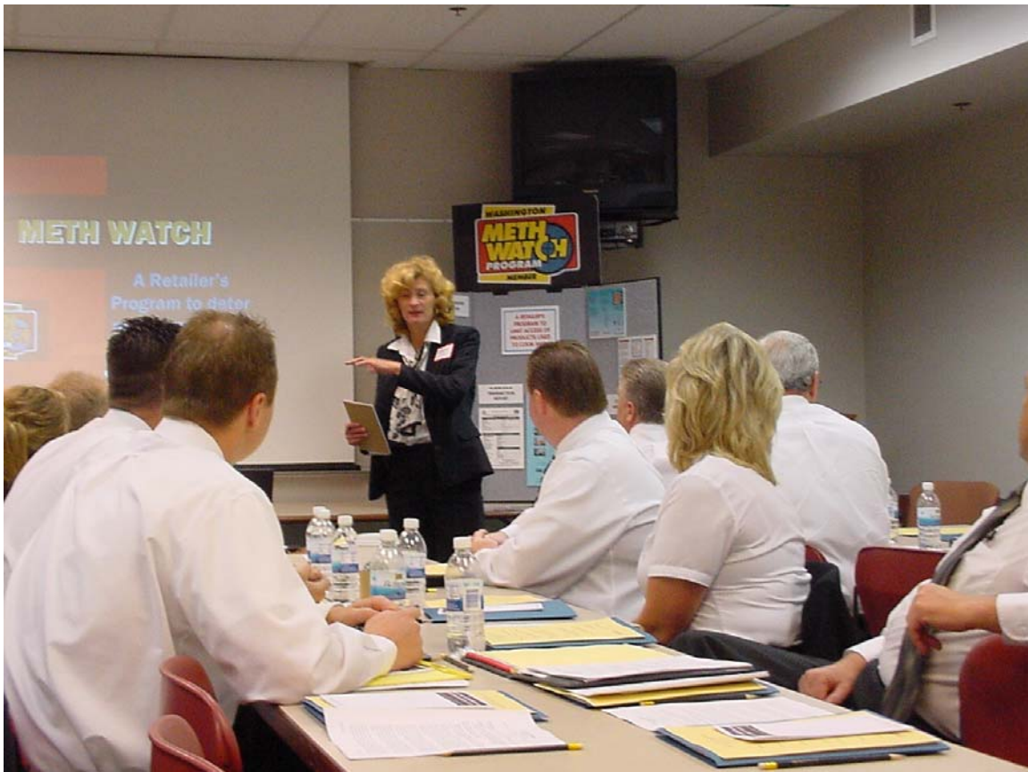
One of several MethWatch trainings given in Thurston County in 2004.

retail clerks and managers and the hosting of a community forum on meth related financial crimes like identification theft and fraud.