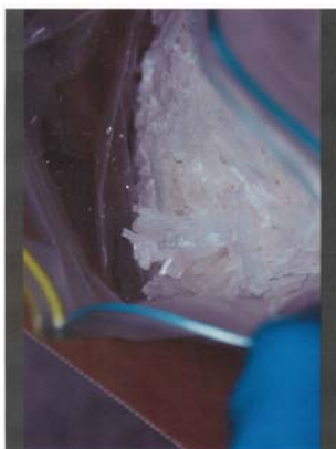
"Ice" or "Crystal" meth.

The Sheriff's Office's Special Enforcement Team continued to work community tips and other investigations to shut down labs in 2004. The team was involved in 41 meth lab cases in Thurston County, which is the same number dealt with in the previous year. The team helped the Narcotics Task Force and other agencies with undercover investigations, some of which involved methamphetamine that had been manufactured outside of the county and brought into the area for distribution. This seems to be an increasing trend; to bring the meth up from California or Mexico. Another trend, noticed in 2004, is increasing sales of a more refined meth that resembles crystals and not the brown or yellow powder that had been more prevalent in years past.