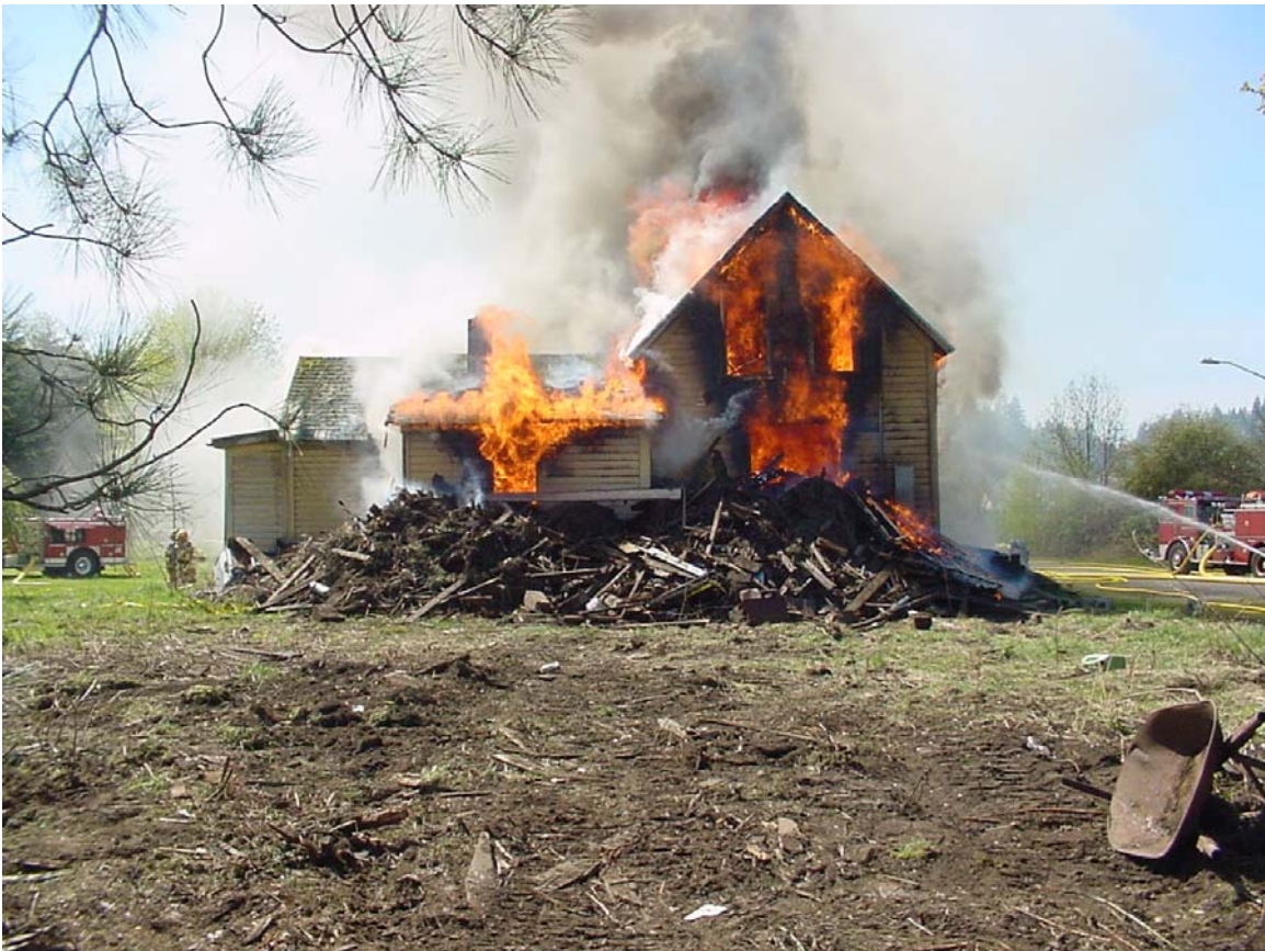
An abandoned home, that had been used as a meth lab, is burned in the town of Bucoda.