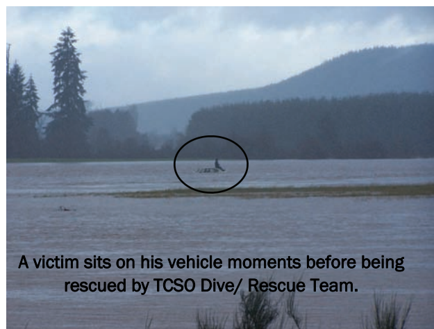
A victim sits on his vehicle moments before being rescued by TCSO Dive/ Rescue Team.