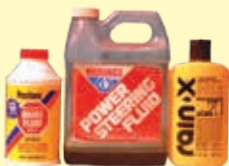
Auto care products