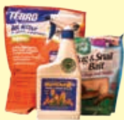
Herbicides & pesticides