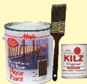
Oil-based paints & stains