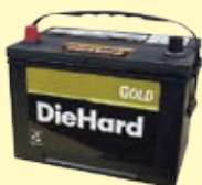
Batteries (except alkaline)