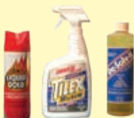
Cleaners & Solvents