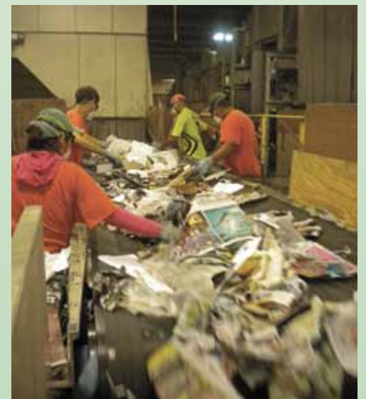
A sort line at SP Recycling.

Have you ever wondered how plastic, metal, and paper items that are combined in one bin get separated out for recycling? All of the stuff you toss into your recycle bin at home goes to SP Recycling in Tacoma, where belts, blowers and magnets shuffle it around until it's properly sorted. Thanks to the internet, you can see how it's done without leaving your living room. To take a virtual tour, click "Publications" on www.ThurstonSolidWaste.org and look in the videos section.