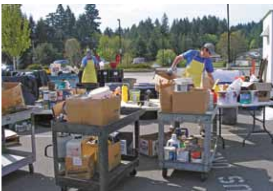
Staff members collect products at the WasteMobile.

The WasteMobile is for Thurston County residents only and will not accept business-generated wastes. Businesses may, however, use HazoHouse at Hogum Bay road for a small fee (see the article above).