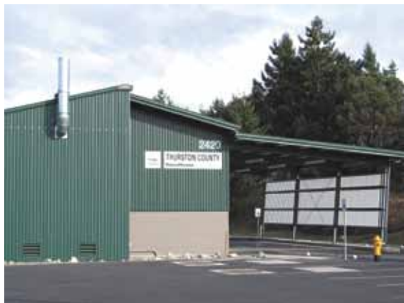
The new HazoHouse.

Thurston County's collection site for unwanted hazardous products has a new home of its own. In March, HazoHouse moved to a new spot at the Thurston County Waste and Recovery Center, located at 2418 Hogum Bay Road N.E. near Lacey.