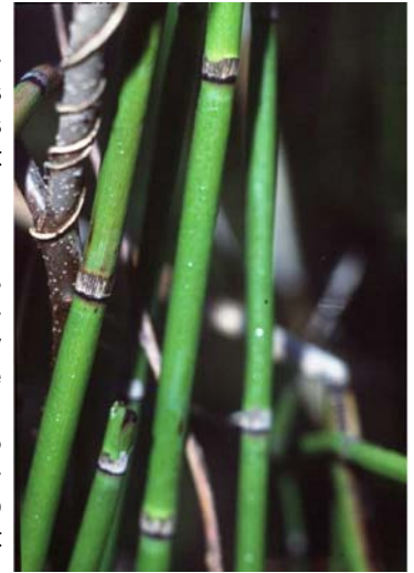
Robert H. Mohlenbrock @ USDA-NRCS PLANTS Database / USDA SCS. 1989.

Because of its hard, waxy cuticle, high silica content, and aggressive rhizomes, horsetail is very difficult to control with herbicides. Currently, glyphosate is the only systemic herbicide active ingredient that is effective in horsetail control and is considered "low in hazard" by Thurston County's pesticide review process. Spot treatment applications with a 2% glyphosate concentration can be used with some success, though one should expect that re-treatment will be necessary. Many herbicide products have an initial glyphosate concentration of 41% (example: Roundup Pro®, Glyphos®, etc.). Follow the label directions to dilute to a 2% concentration. Pre-mixed, ready to use glyphosate products do not contain enough active ingredient to control horsetail. Use a hand-held or backpack sprayer to spray the plants until they are wet but not dripping. Before spraying, trampling or dragging a rake across plants to bruise the cuticle will assist herbicide penetration. Glyphosate is non-selective, and will injure any plants that it comes in contact with, including grass.