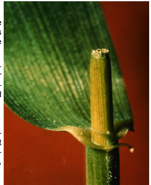
Close-up of quackgrass leaf attachment.

Glyphosate is the active ingredient in many systemic herbicides (Glyphosate Original® , Roundup Pro®, etc.) that are effective in controlling quackgrass. Also, glyphosate is the only systemic herbicide active ingredient that has been reviewed by Thurston County and is rated as low in hazard. Glyphosate products have been shown to accomplish up to 95% control of quackgrass.