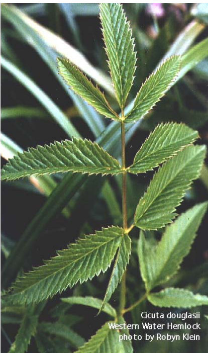
Cicuta douglasii Western Water Hemlock