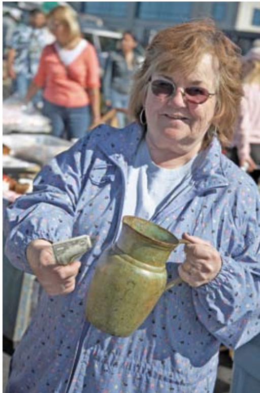
Trade, sell and barter with community members May 2.

Join the fun at Thurston County's first annual Community Garage Sale and Reuse Fair! The event will be held Saturday, May 2 from 8 a.m. to 3 p.m. at the Thurston County Fairgrounds, 3054 Carpenter Road S.E. in Lacey.