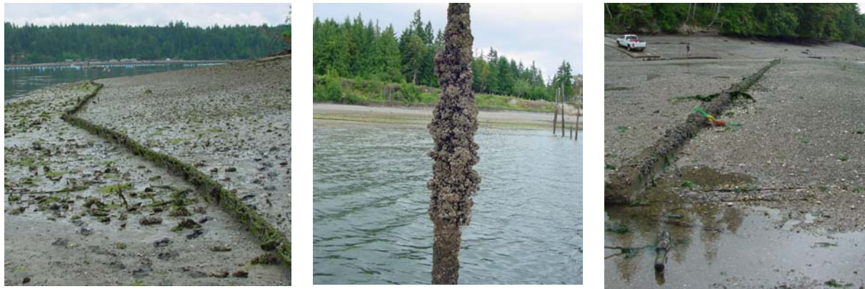
a) Deepwater Point predator fence b) North Totten piling c) Little Skookum concrete dike

appear to die off during their second summer of life and no intertidal populations were located in 2002. Random and non-random samples were collected from a concrete oyster dike at the location described in Figure 3c.