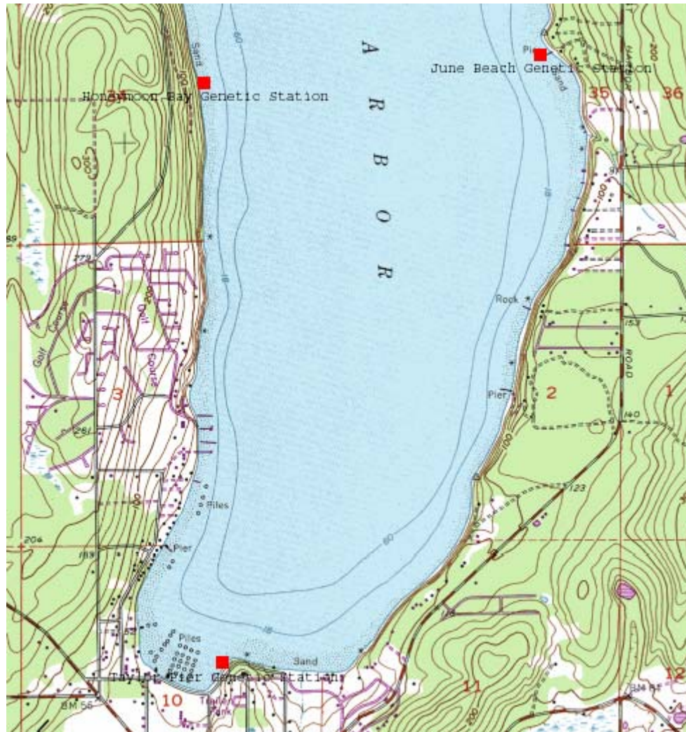
Figure 3. Mussel sample site locations in Holmes Harbor examined during 1996 and 1997.

Totten Inlet. The Deepwater Point site is adjacent to an existing mussel farms where >450 metric tonnes of M. galloprovincialis are harvested each year from raft cultures. The beach was searched for ca. 300 m on either side of the farm for intertidal mussels. However, too few mussels were found to allow for a random survey. Mussels resembling M. galloprovincialis were collected from a fallen log and the random samples were collected from a shellfish predator net installed to protect oysters from starfish and crabs (Figure 4a).