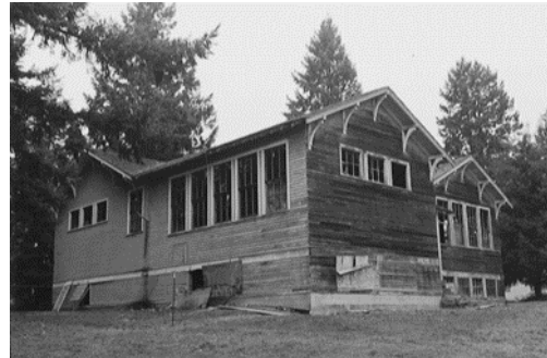
Lackamas School House 1917-2019

www.co.thurston.wa.us/permitting/historic/historic-home.html