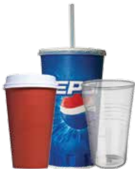
To Go cups