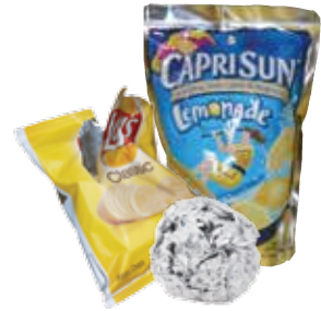
Aluminium foil, foil wrappers and drink pouches