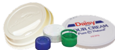
Lids and caps