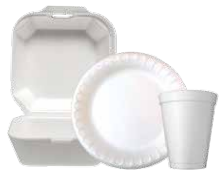
Styrofoam cups, plates and clamshells