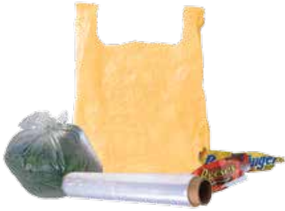
Plastic bags, film and wrappers

These items will contaminate recycling and organics containers.