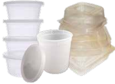
Clear plastic tubs and clamshells