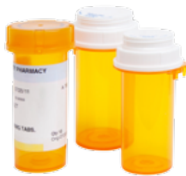
Straight-sided prescription bottles