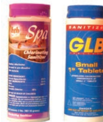
Pool & spa supplies