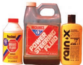
Auto products: used oil filters, antifreeze, car batteries, brake fluid