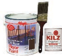
Oil-based paints, spray paint, paint thinners, primers, stains