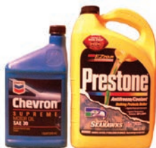
Used motor oil (see back), contaminated oil, gasoline, and kerosene