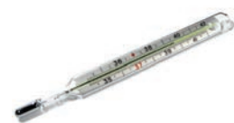
Products containing mercury (thermostats, thermometers, and switches)