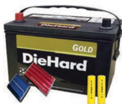
All types of batteries EXCEPT alkaline (up to 3 car batteries per residential customer per day)