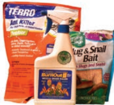
Pesticides: weed and bug killers