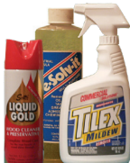
Cleaners & solvents