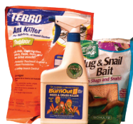
Herbicides & pesticides (liquid & solid)

For a complete list of accepted items, and to learn how to safely pack and transport items, go to ThurstonSolidWaste.org/Hazo or call 360-867-2912.