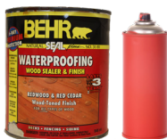
Oil-based paints, stains, & all aerosols