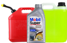
Oils, fuels, & auto care products