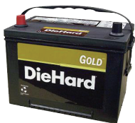
Batteries (except alkaline)